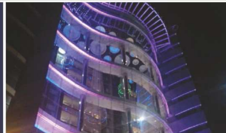
GBS Tower & Hilton Double Tree Dubai