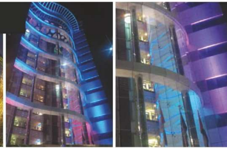
GBS Tower Hilton Double tree